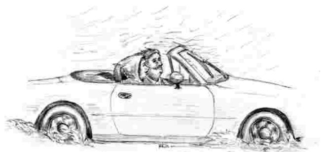
Put up the top, who cares what your Miata Nuts think.

ZOOMIN - YOUR MIATA WILL BE MOVIN THROUGH A LOT OF CURVES WITH SPIRITED DRIVING